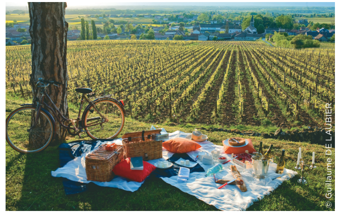
Hôtel Frédéric Carrion, picnic basket in a vineyard